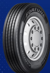
FAR602 ET Regional All Position