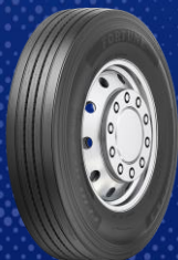
FFH130 ET Long Haul Steer