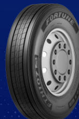
FTH107 ET Long Haul Trailer