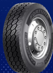
FAM211 Mixed Service