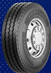
FAM210 Mixed Service