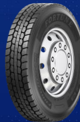
FDR601 ET Regional Drive