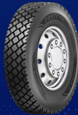
FDM213 Mixed Service