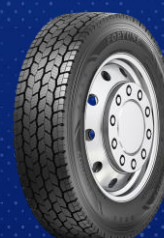
FDW802 Regional Winter Drive