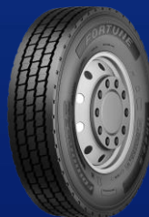
FDH106 ET Long Haul Drive