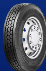
FDH131 Regional Drive