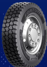
FDM212 Mixed Service