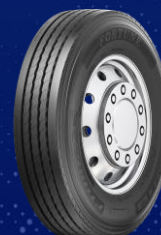
FTH102 Severe Service Trailer