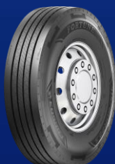
FAR603 Long Haul Coach Bus