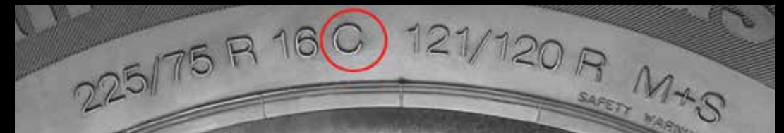
FIGURE 3: Size and Service Description of an Example C-Type European Commercial Metric Tire

The “C” at the end of the size designation in Figure 3 below identifies the tire as a C-Type European Commercial Metric tire. The “C” is not a load range. The load range is marked separately on the tire sidewall as shown in Figure 4.