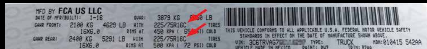
FIGURE 1 (Above): Example Vehicle Certification Label

Figures 1 and 2 are examples of placards from one of these increasingly popular model vans. These placards show that European C-Type tires are specified (note the “C” at the end of the tire size code).